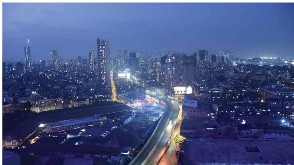
Mumbai: BMC to construct three six-lane flyovers on Goregaon-Mulund Link Road (Representational Image)