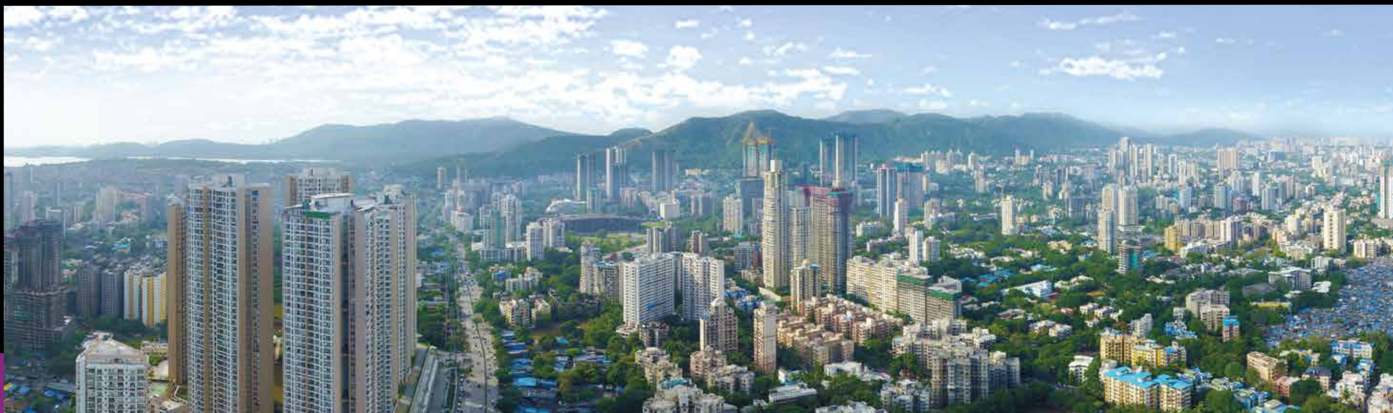
WEST SIDE VIEW