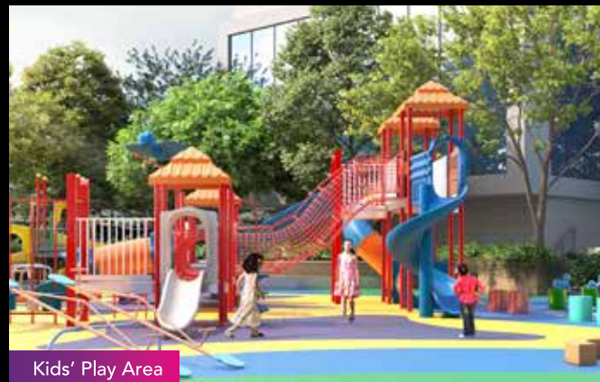
Kids' Play Area