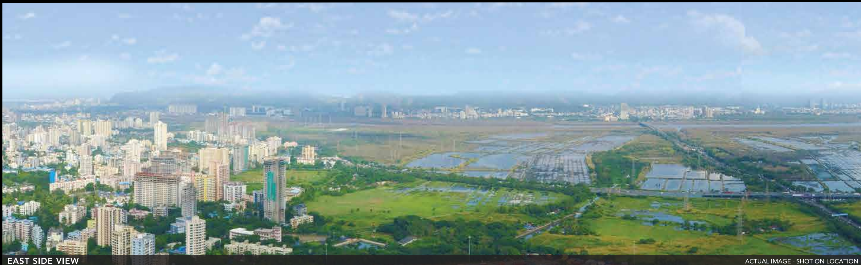
EAST SIDE VIEW