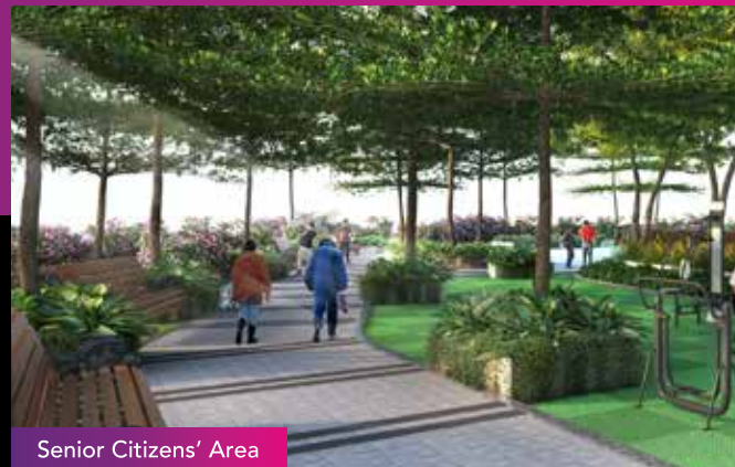
Senior Citizens' Area