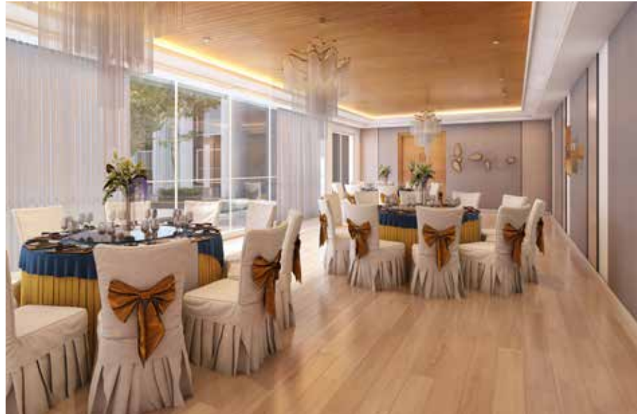
A Banquet Hall for celebrations that turn into unforgettable memories.