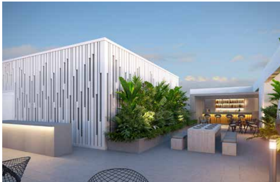
Rooftop Bar and Party Lounge: To turn ordinary evenings with friends into evenings to remember.