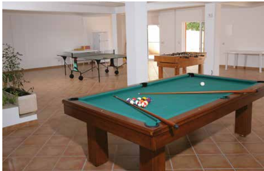
An Indoor Games Room to turn neighbours into friends.