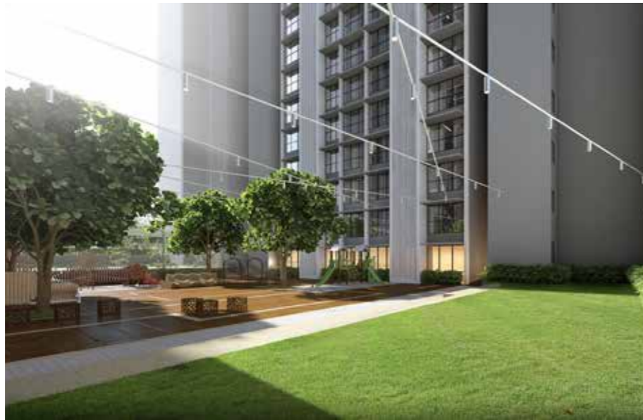
Open To Sky Podium: So you never miss the sun, the breeze and the great outdoors.