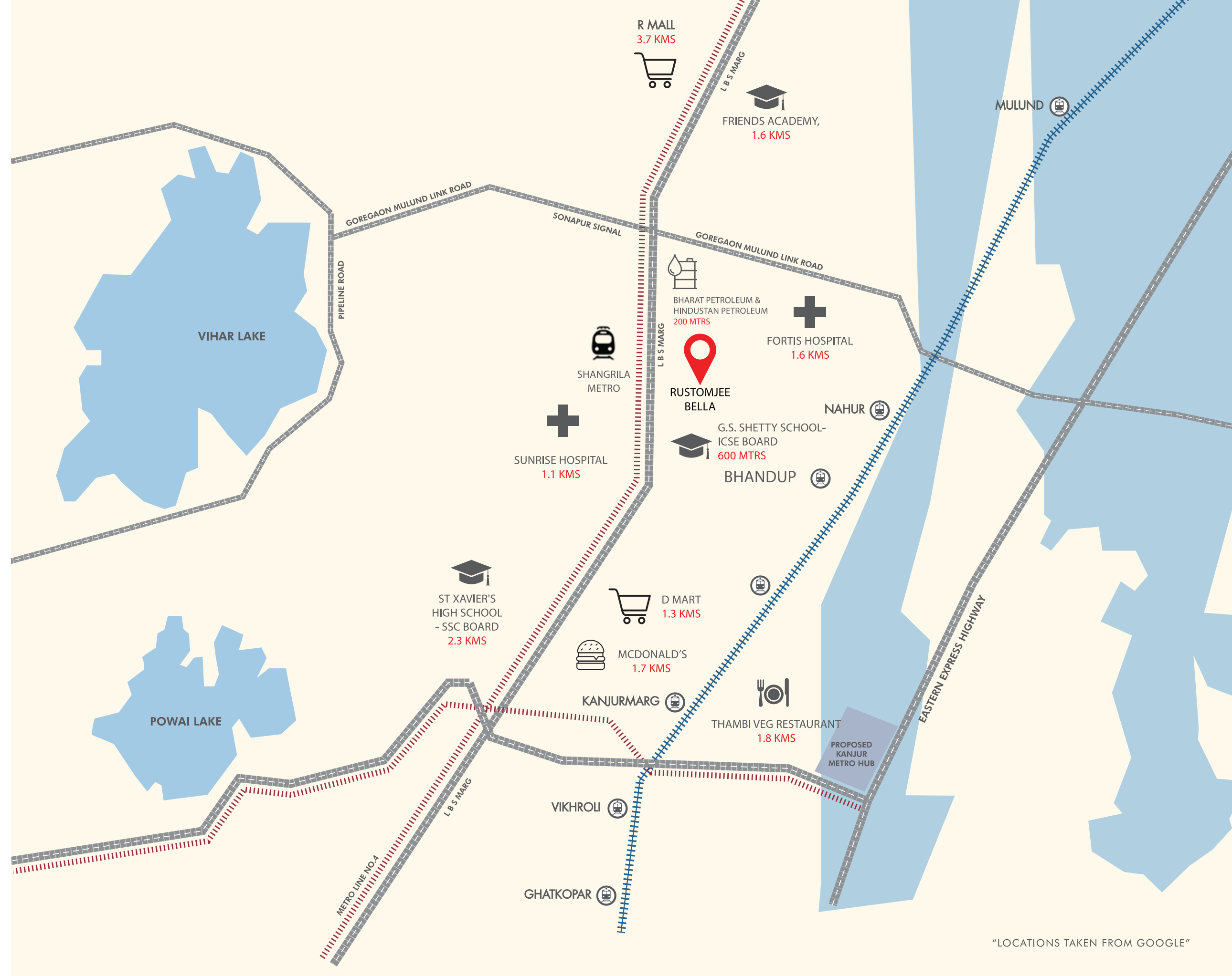
"LOCATIONS TAKEN FROM GOOGLE"