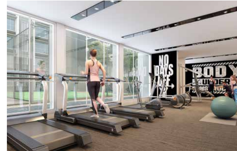
A Fitness Centre to make self-care part of the routine.