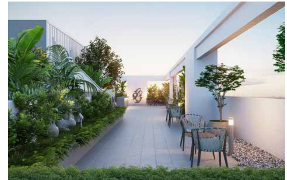
Rooftop Seating Area: The perfect place to enjoy a sunrise, a sunset and everything in between.