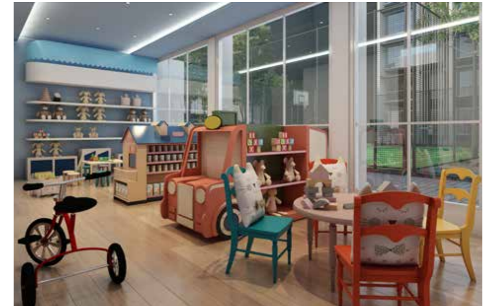
A Children's Play Area where there's just one rule: Run.