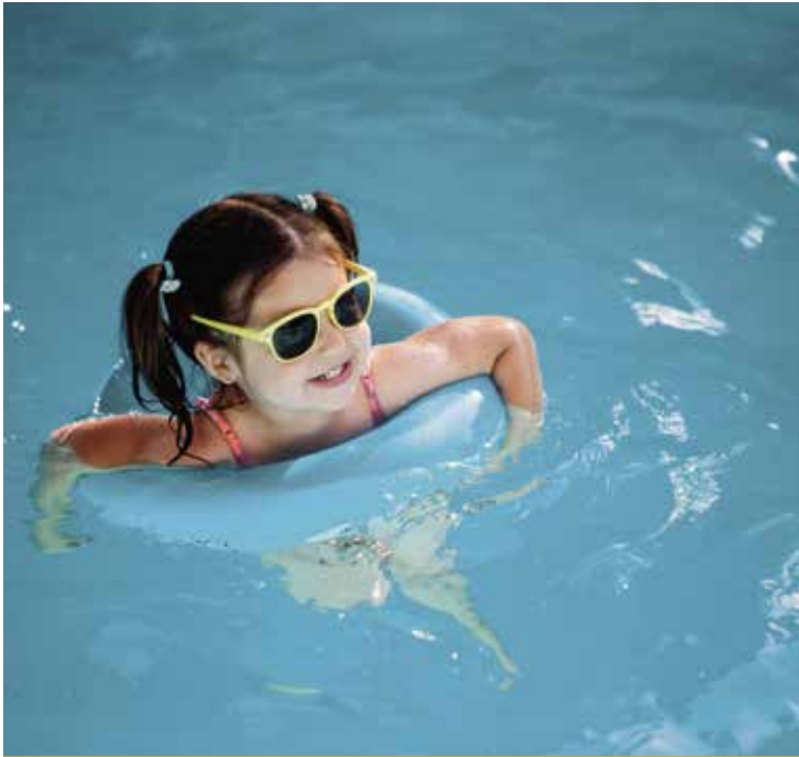
Lagoon Pool & Kid's Plunge Pool