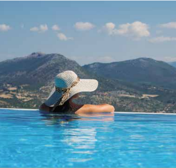
Infinity Edge Lap Pool