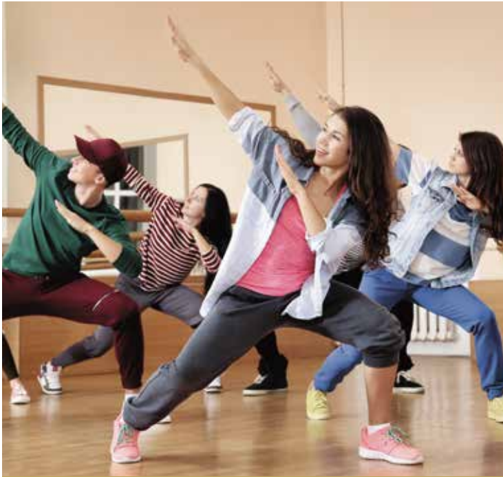
Dance Fitness Studio