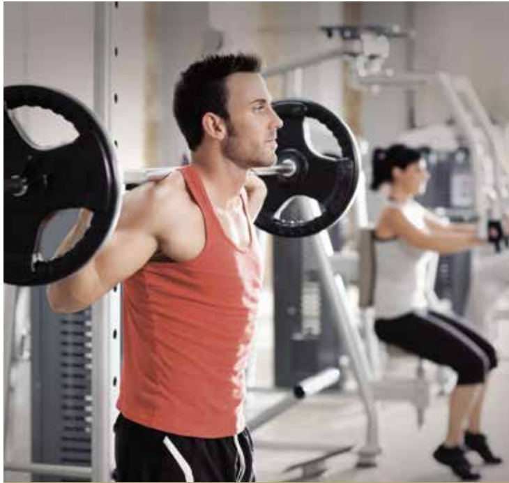
Fitness Club - Strength Training