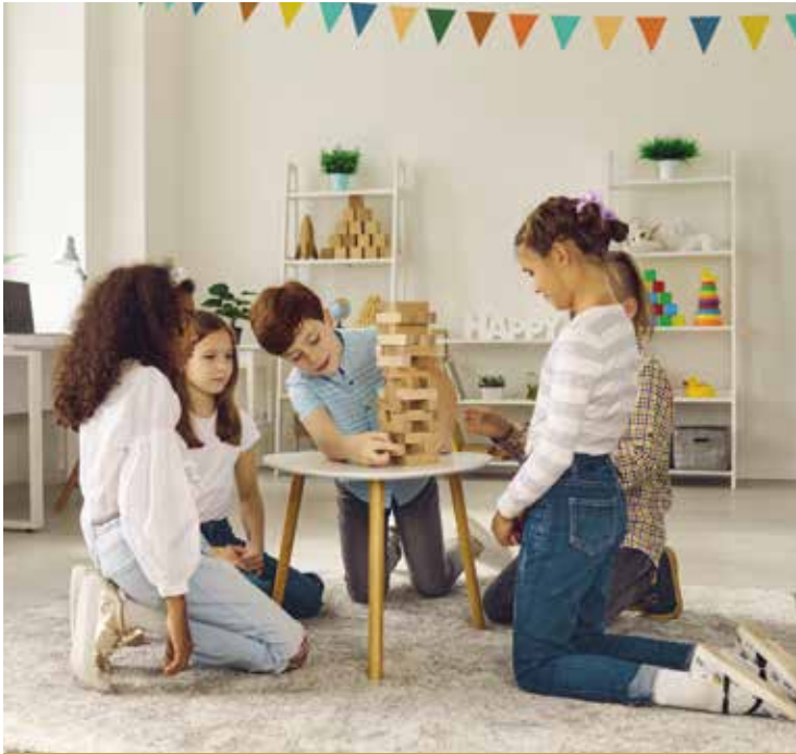
Kid's Activity Center