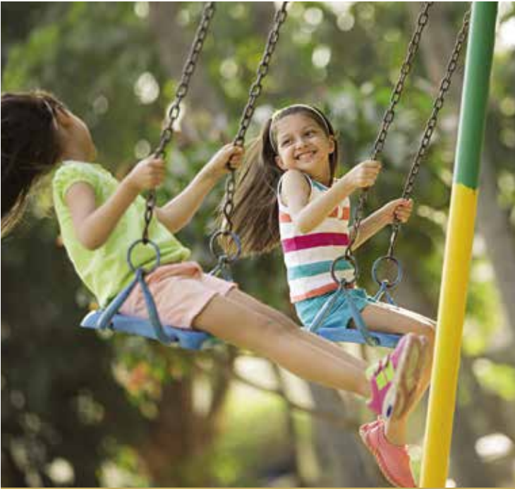
Kid's Play Zone