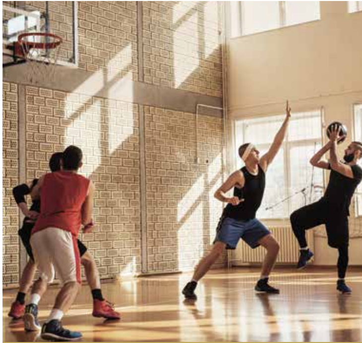
Indoor 3 on 3 Basketball Court