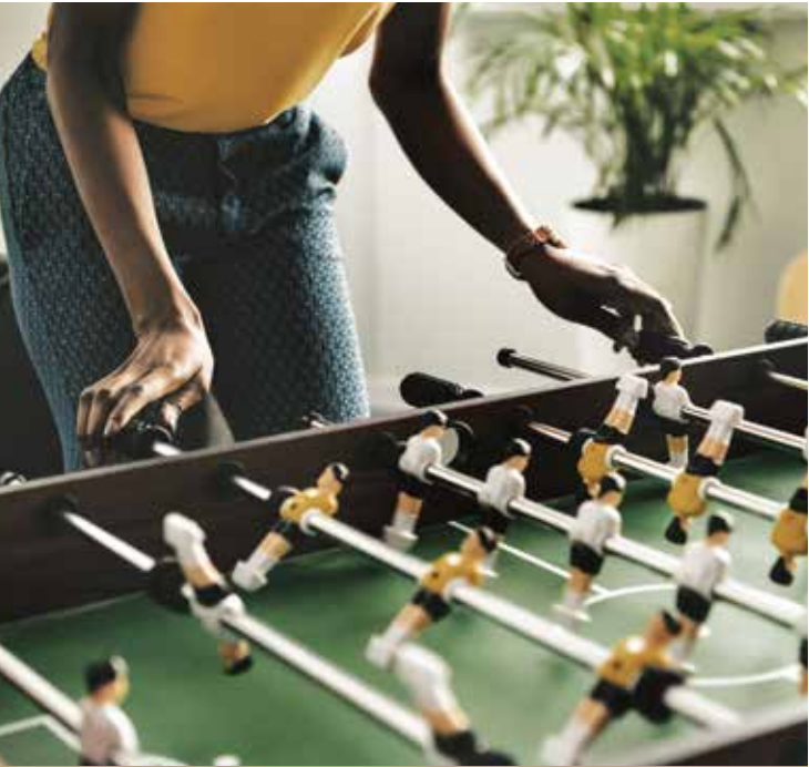
Indoor Games Arena