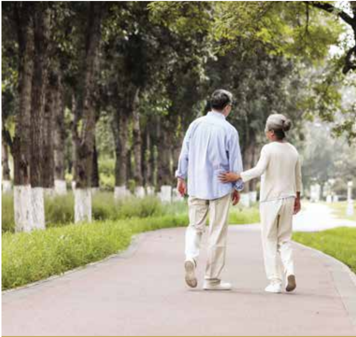
Nana Nani Park