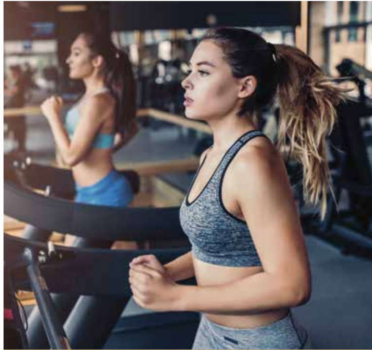
Fitness Club - Cardio