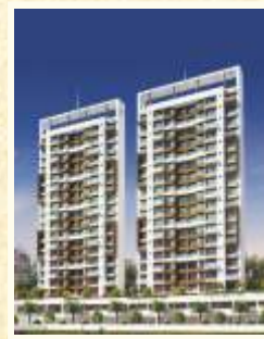
SAI PROVISO AASHLESHA Koparkhairane