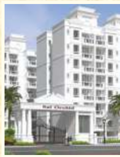
SAI ORCHID PHASE 1 Dombivali East