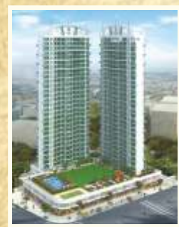
GREEN WOODS Kharghar