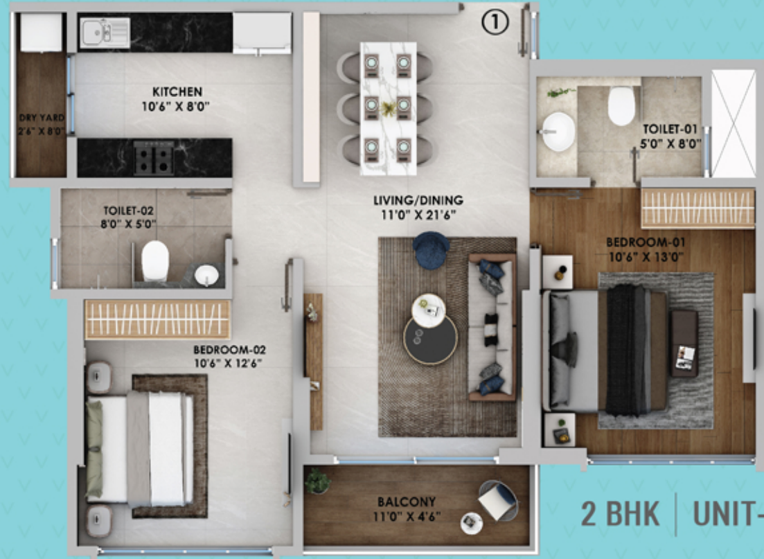
2 BHK | UNIT-1