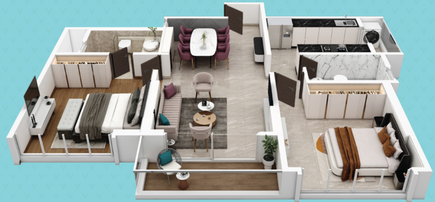
2 BHK | UNIT-2