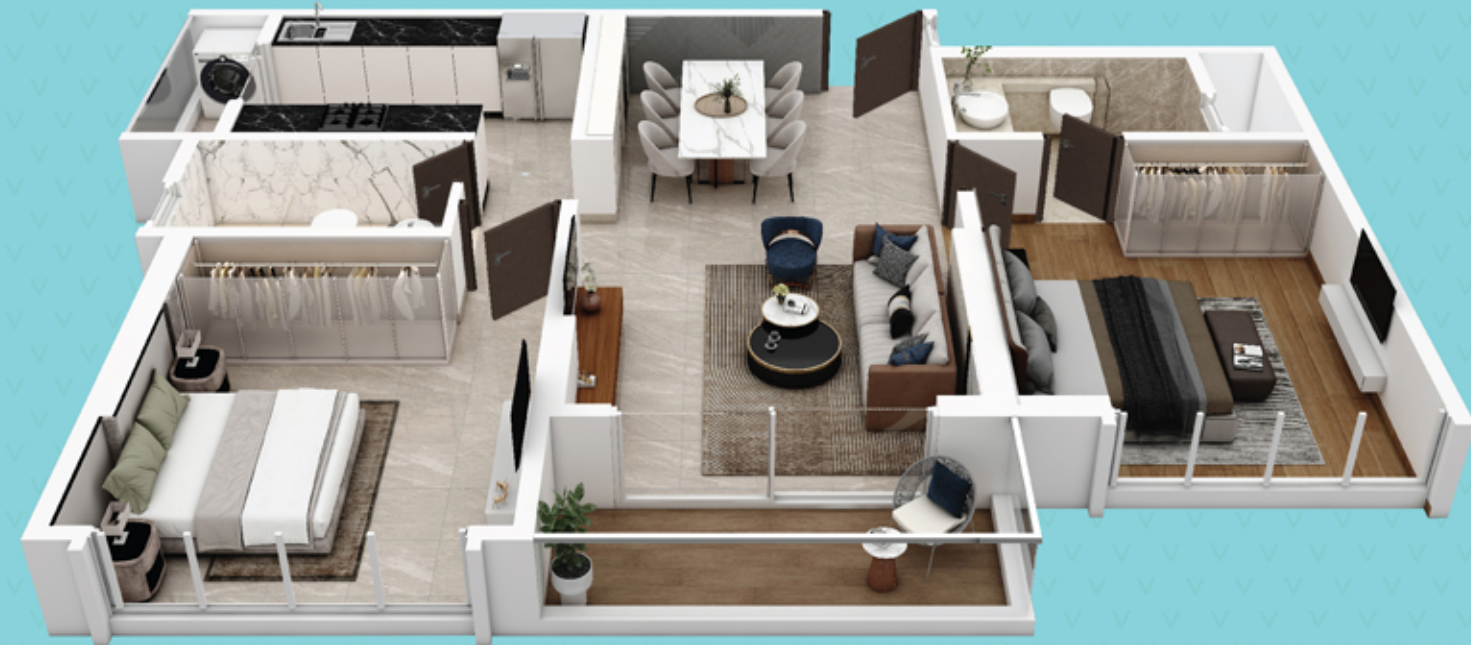
2 BHK | UNIT-1