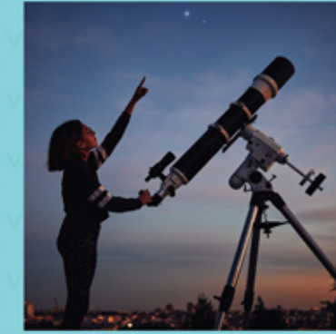
Star Gazing Area