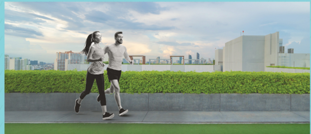
Rooftop Walking Track