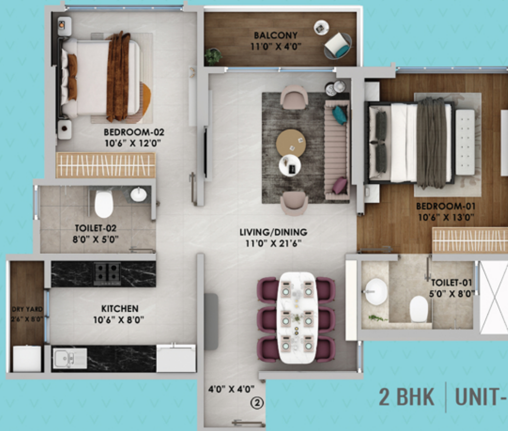
2 BHK | UNIT-2